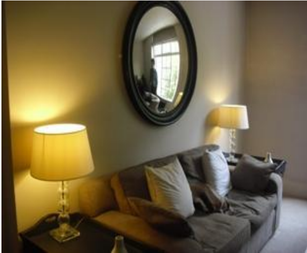
Chipped paint on one of the coffee tables