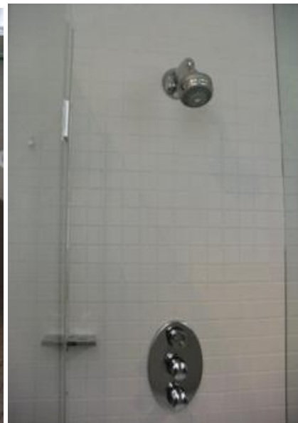
Stained Wall and pipe in the bathroom